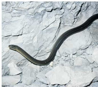
The harmless Aesculapius snake – here in the first tunnel – grows up to two metres in length.

Grade: Adequate, well marked paths, but not always very wide. Sure-footedness and