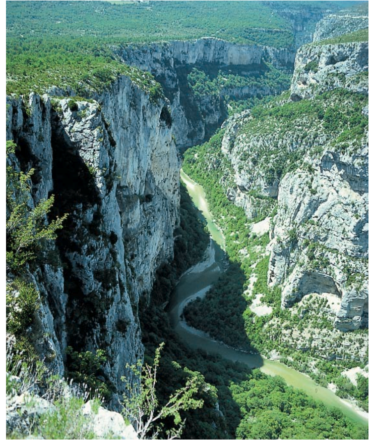
Dizzying view down into the Gorges du Verdon.

rugged couloir. Then cross a tributary and go up steeply over steps to a car park (sometimes taxis). At its left-hand end take the red and white marked path (GR 4), which ascends steeply to the D 952, which is followed to the left for about 150 metres to the Auberge du Point Sublime (783m; 50 min). From here return by taxi to the starting point of la Maline.